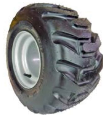
HEAVY DUTY LUG