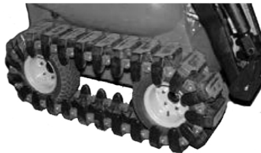
TRACK OVER TYRE