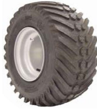
DINGO MULTI PURPOSE