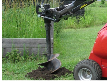
POST HOLE AUGER