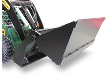
4 IN 1 BUCKET